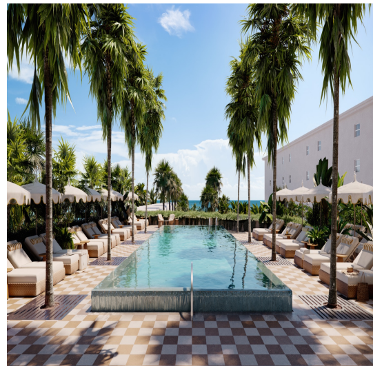
(fourth floor pool)