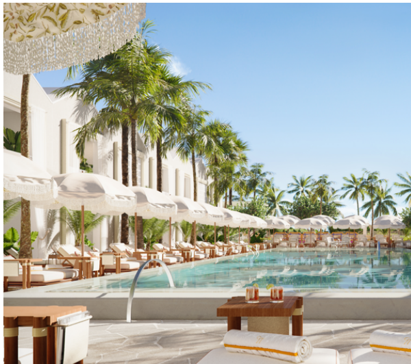
(ground floor pool)

Pool and beach operations are managed by hotel staff with controlled access, dedicated attendants and food and beverage service coordinated through Gigi Rigolatto.