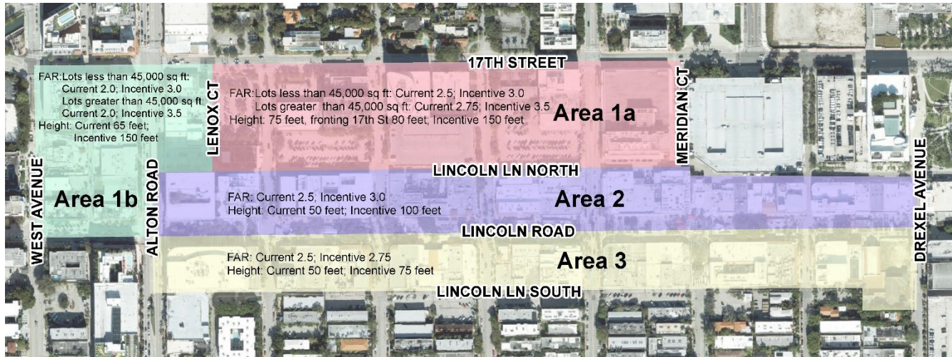
Map of the four (4) areas subject to proposed draft incentives