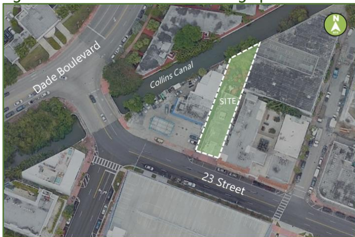
Figure 1 – Site Location Aerial Photograph

Vala Group, Inc. prepared this traffic-generation statement for the existing Rain nightclub located at 323 23 rd Street, Miami Beach, Florida. The nightclub operated until July 4, 2023, with a maximum capacity of 550 people. The property owner wishes to increase the maximum capacity to 586 people but will not increase the building area. Figure 1 shows the site location. We prepared trip-generation estimates for the existing and proposed development and determined that it will not increase the number of daily, AM peak hour, or PM peak hour vehicle trips generated by the site. The site is comprised of one 0.20-acre parcel (Folio Number: 02-3226-001-0540) and has frontage on 23 rd Street. Valet parking service will not be provided. Attachment A contains the property appraiser data. This report provides trip-generation calculations for the project.