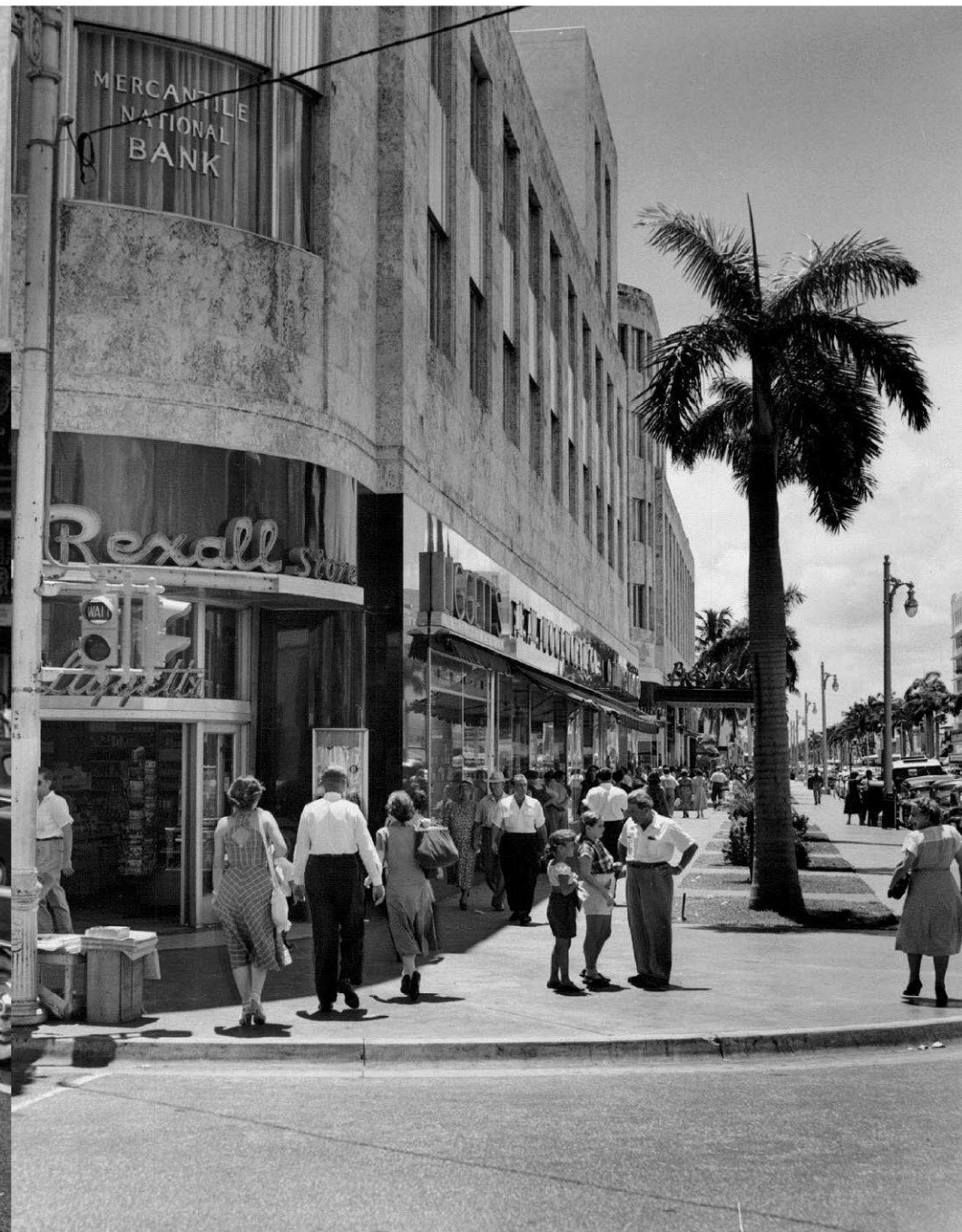
Mercantile National Bank Building (a.k.a. 420 Lincoln Rd. Building) Lincoln Road Mall corner of Washington & Lincoln