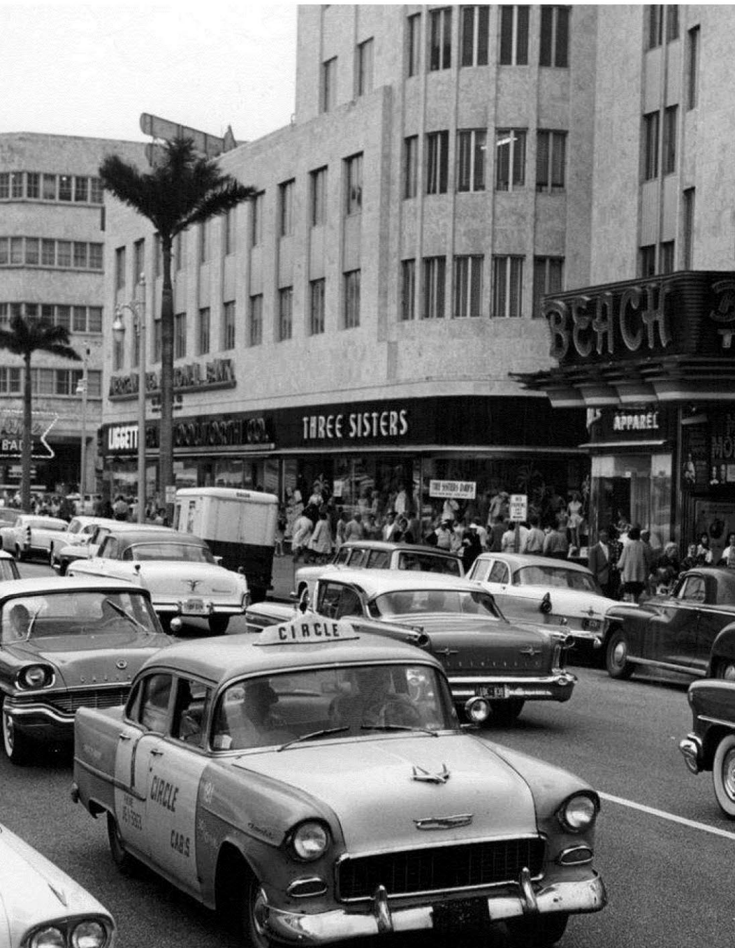
View east on Lincoln Road toward the Mercantile National Bank Building (a.k.a. 420 Lincoln Rd. Building), 1950s.