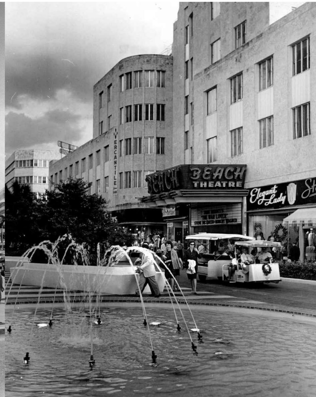
Lincoln Road Mall fronting the Mercantile National Bank Building (a.k.a. 420 Lincoln Rd. Building) in 1962