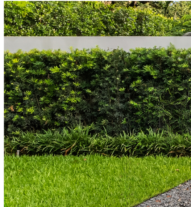
POD | PODOCARPUS