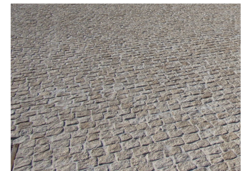
DRIVEWAY HARDSCAPE MATERIAL