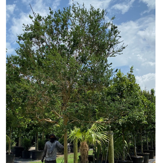
MF | SIMPSON STOPPER TREE