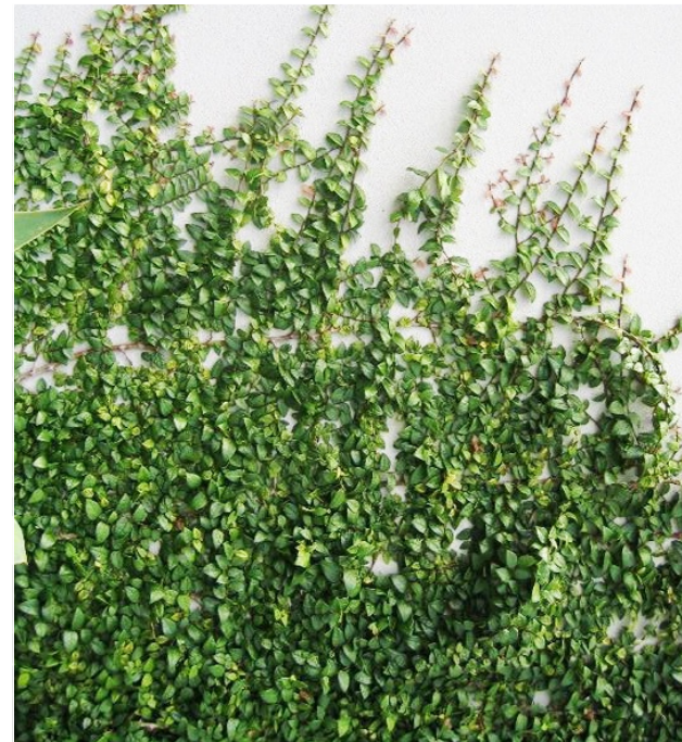
FIP | CREEPING FIG