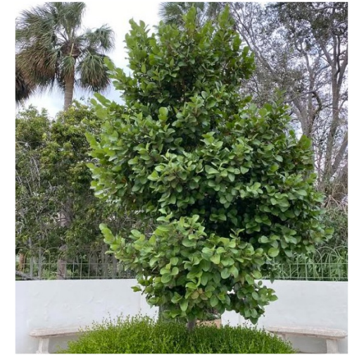
CO | NATIVE SEA PLUM TREE