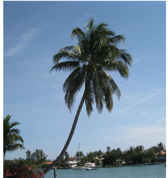
CN | COCONUT PALM