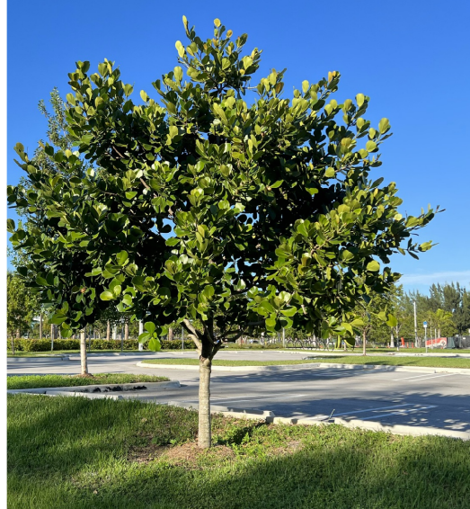
CR | CLUSIA ROSEA