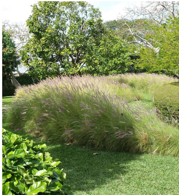
PEN | PENNISETUM