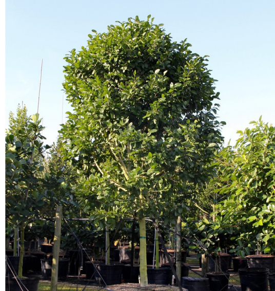
CD | PIGEON PLUM