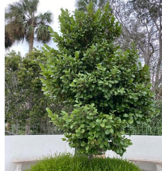
CO | SEA PLUM TREE