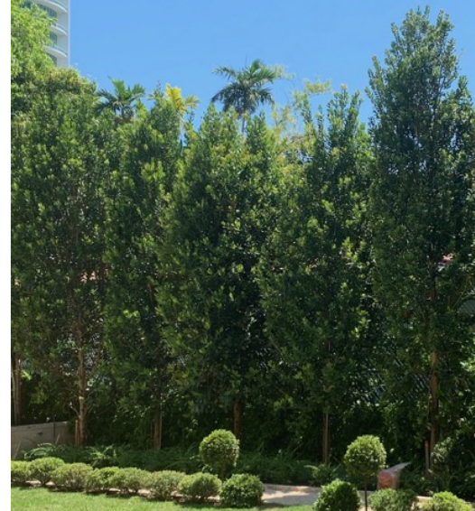
PR | BAYRUM TREE