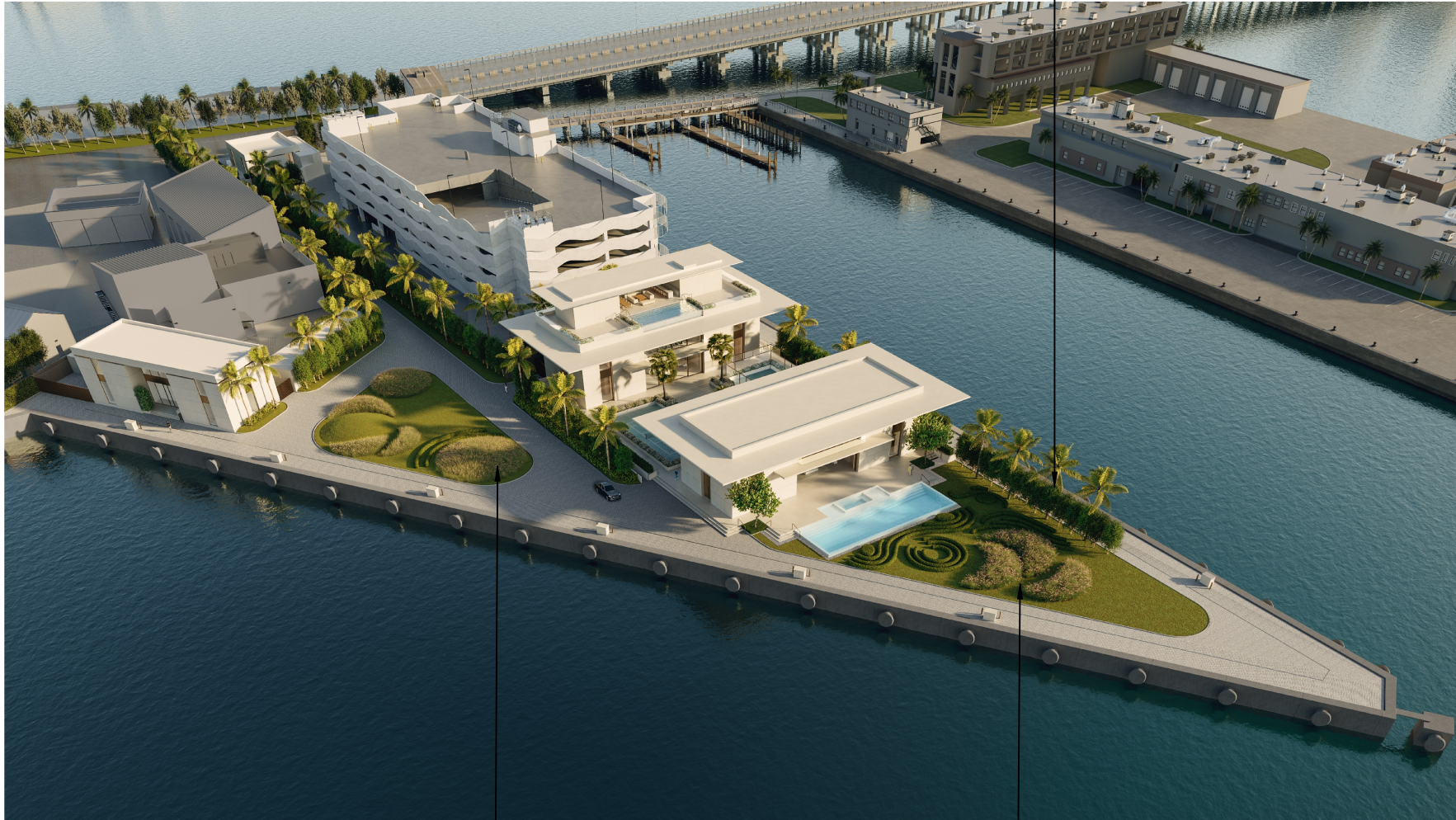
OPEN LAWN WITH SCULPTURAL FICUS 'GREEN ISLAND' SHRUBS AND SOFT WHITE FOUNTAIN GRASS