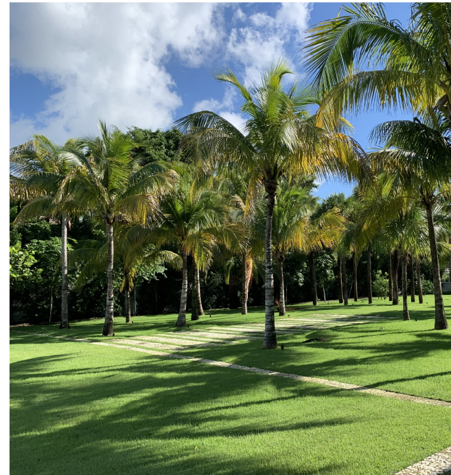
CN | COCONUT PALMS

TALL PALMS TO ENHANCE THE CHARACTER OF THE SITE DESIGN WHILE PROVIDING ADDITIONAL SCREENING