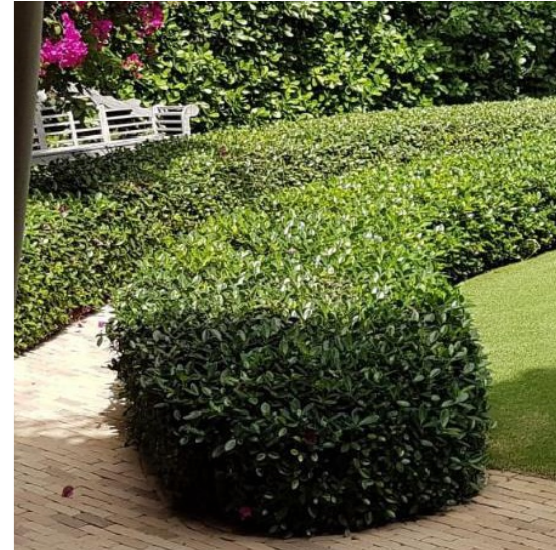
FGI | FICUS GREEN ISLAND