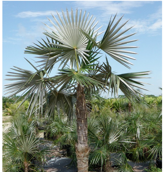
CM | COCCOLITHRINAX MIRAGUAMA