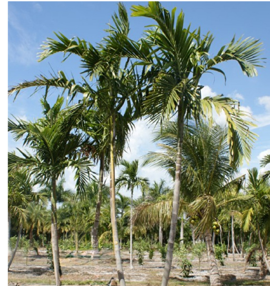
PE | ALEXANDER PALM