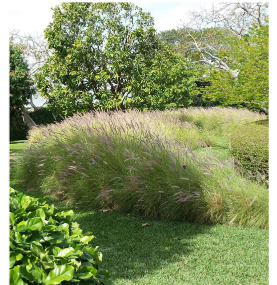
PEN | WHITE FOUNTAIN GRASS