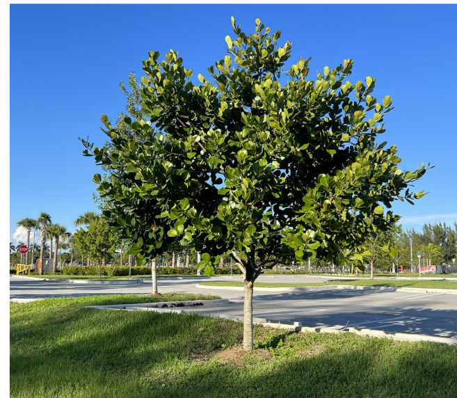
CR | CLUSIA ROSEA