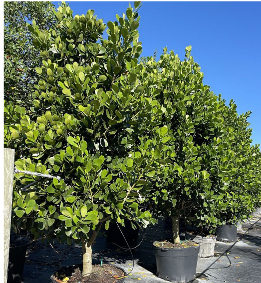
CG | CLUSIA GUTTIFERA