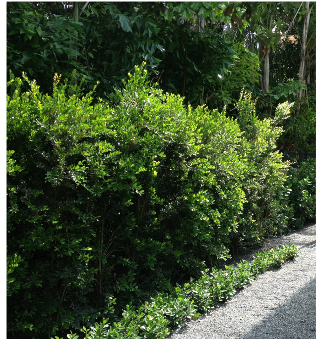
EUJ | SPANISH STOPPER SHRUB