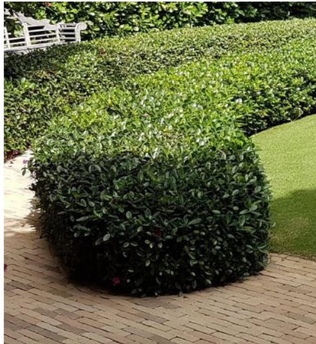
FGI | FICUS GREEN ISLAND