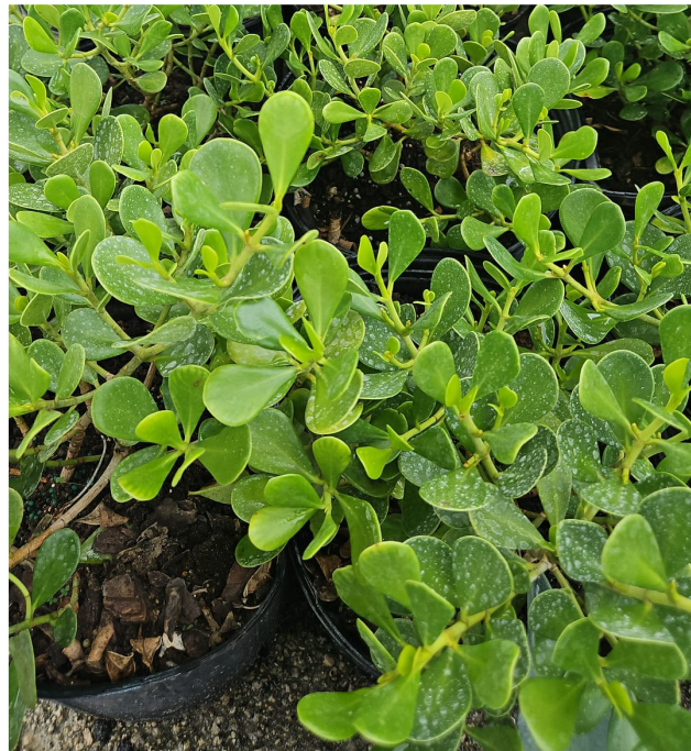
CRN | CLUSIA ROSEA 'NANA'