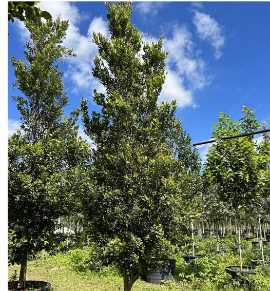
EF | SPANISH STOPPER TREE