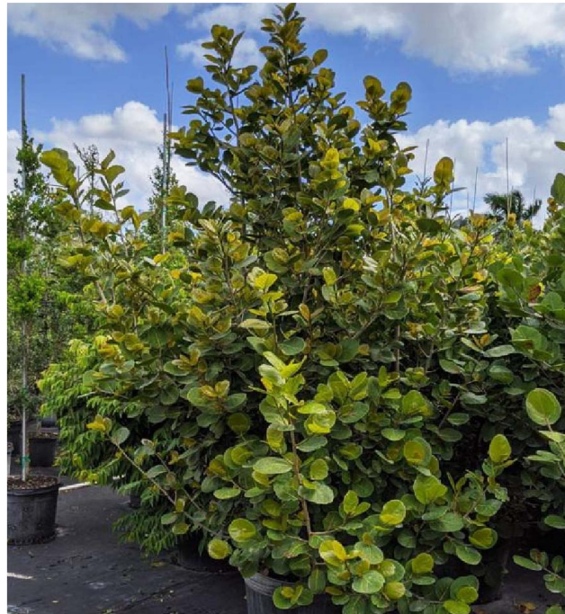
COD | SEA PLUM SHRUB