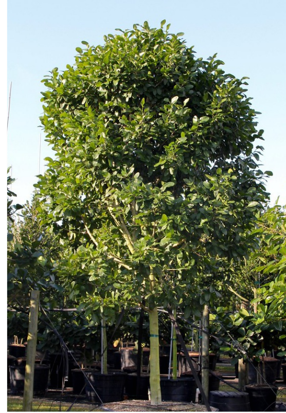
CD | NATIVE PIGEON PLUM TREE