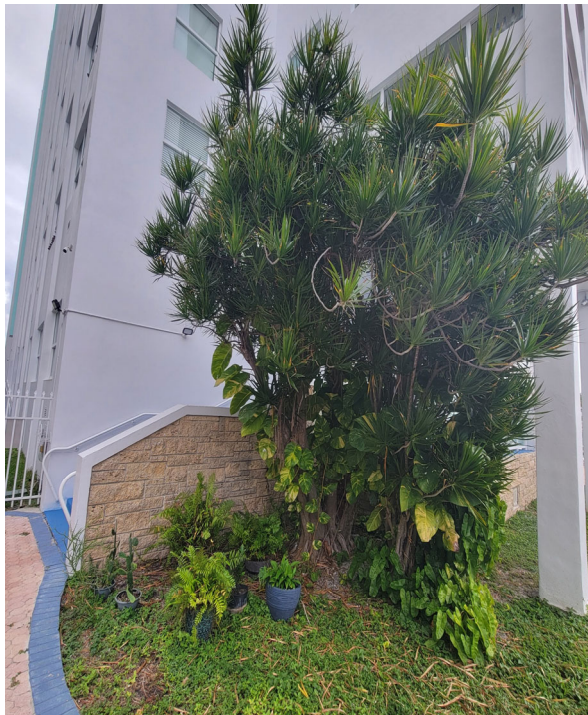
Tree 45 dragon tree ( Dracaena Marginata ) 15 inch DBH, Good condition 20 foot height, 18 foot spread