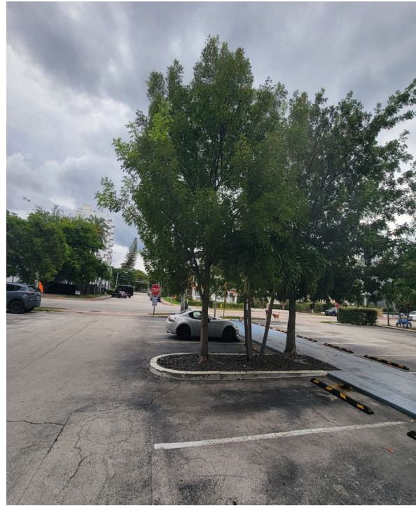
Tree 34 mahogany (Swietenia mahagoni) 10 inch DBH Good condition 32 foot height, 32 foot spread