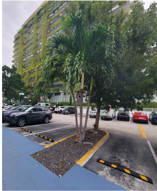
Tree 30 christmas palm (Adonidia merrellii) 5,5,5 inch DBH Good condition 12 foot height, 6 foot spread