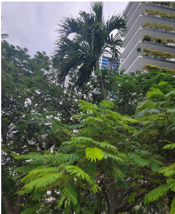
Tree 39 Alexander palm ( Archontophoenix alexandrae ) 5 inch DBH, Good condition 25 foot height, 6 foot spread