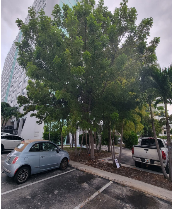
Tree 17 mahogany (Swietenia mahagoni) 9 inch DBH, Good condition 35 foot height, 35 foot spread