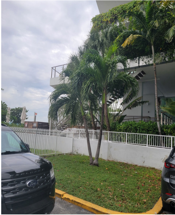
Tree 37 christmas palm ( Adonidia merrellii ) 6,6 inch DBH, Good condition 16 foot height, 6 foot spread