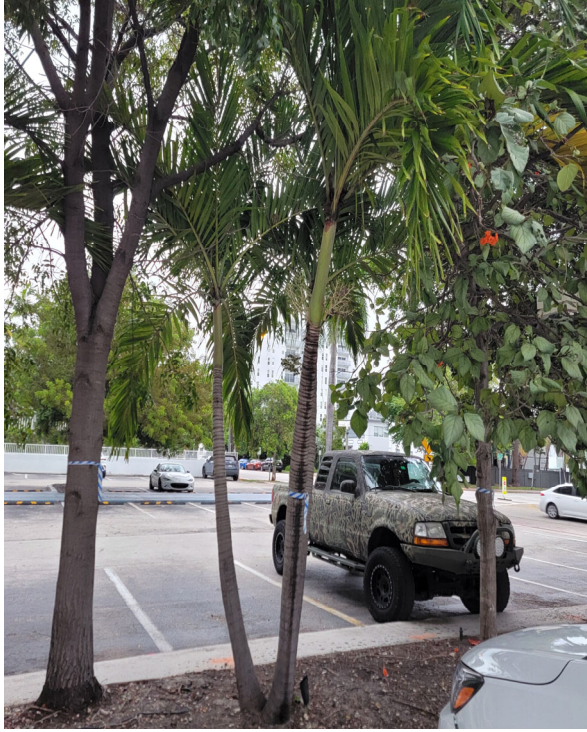
Tree 9 Christmas palm ( Adonidia merrellii ) 5,4,4 inch DBH, Good condition 12 foot height, 8 foot spread