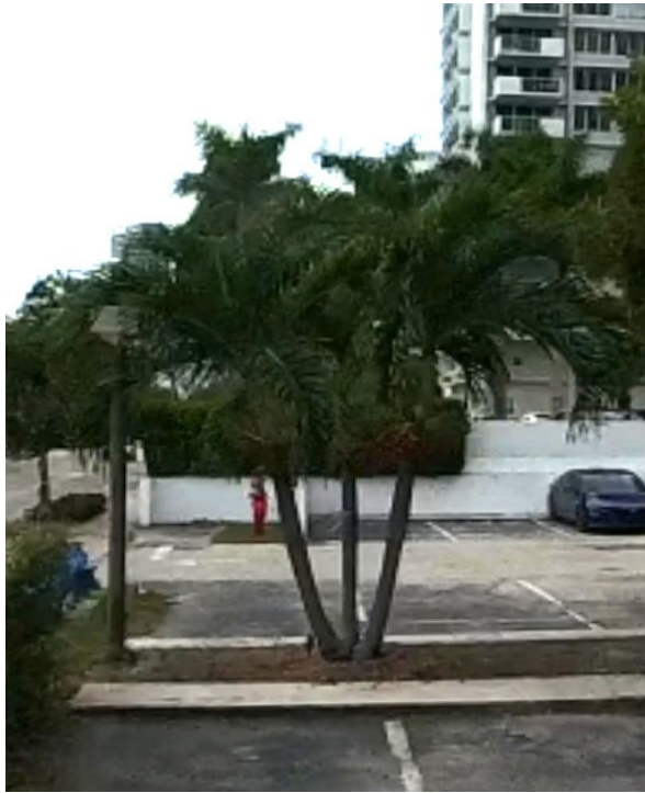
Tree 5 Christmas palm ( Adonidia merrellii ) 6,5,5 inch DBH, Good condition 12 foot height, 8 foot spread