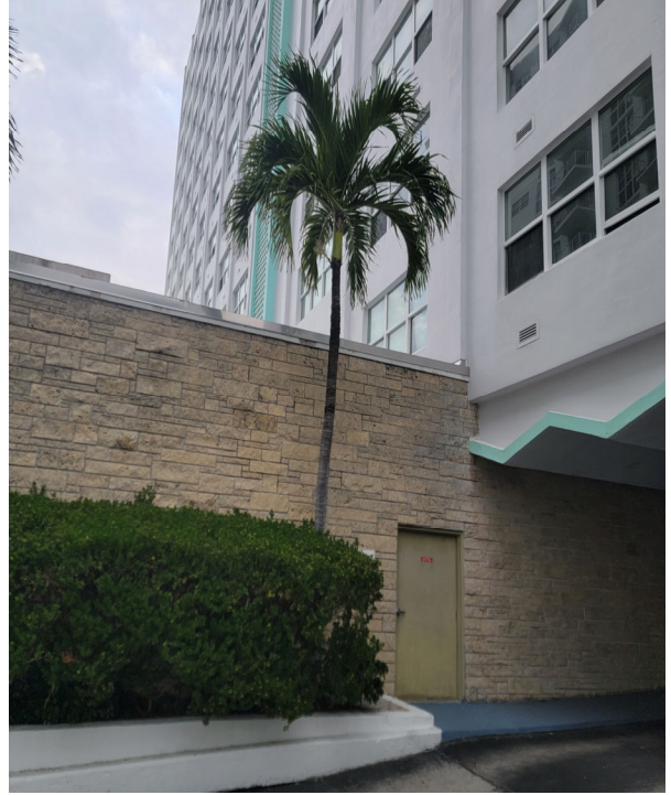
Tree 26 Alexander palm ( Archontophoenix alexandrae ) 8 inch DBH Good condition 25 foot height, 6 foot spread