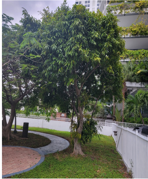
Tree 38 long leaf fig ( Ficus maclellandii ) 12 inch DBH Good condition 20 foot height, 22 foot spread