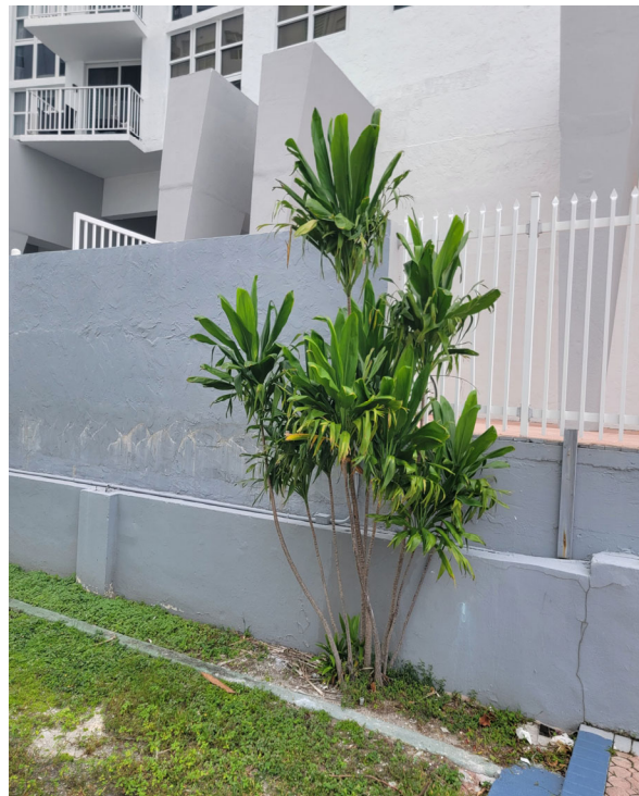
Tree 48 Cordyline hybrid ( Cordyline hybrid ) 3 inch DBH Good condition 10 foot height, 10 foot spread