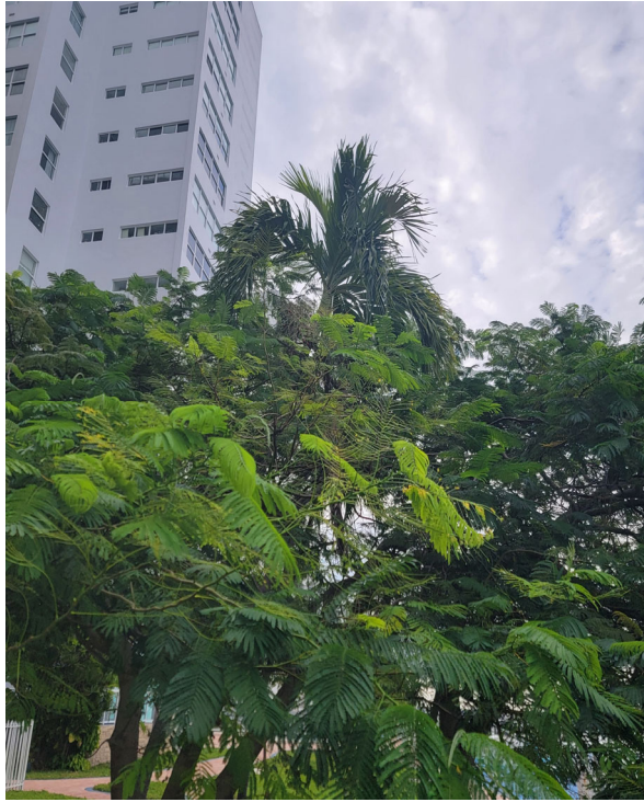
Tree 41 Alexander palm (Archontophoenix alexandrae) 5 inch DBH, Good condition 25 foot height, 6 foot spread