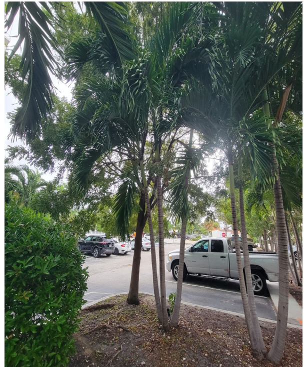
Tree 22 Christmas palm ( Adonidia merrellii ) 6,6,6 inch DBH Good condition 18 foot height, 8 foot spread