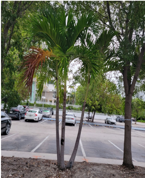
Tree 11 Christmas palm ( Adonidia merrellii ) 4,4,4 inch DBH, Good condition 10 foot height, 8 foot spread