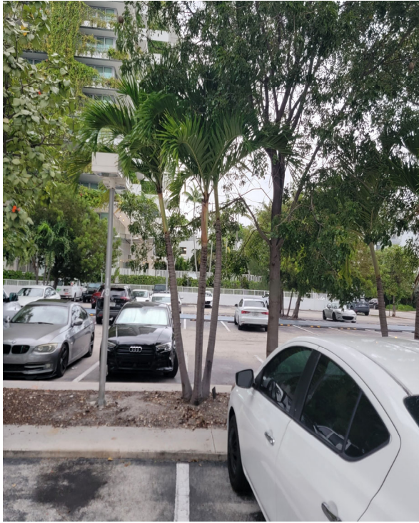
Tree 13 Christmas palm (Adonidia merrellii) 5,5,5 inch DBH, Good condition 12 foot height, 8 foot spread