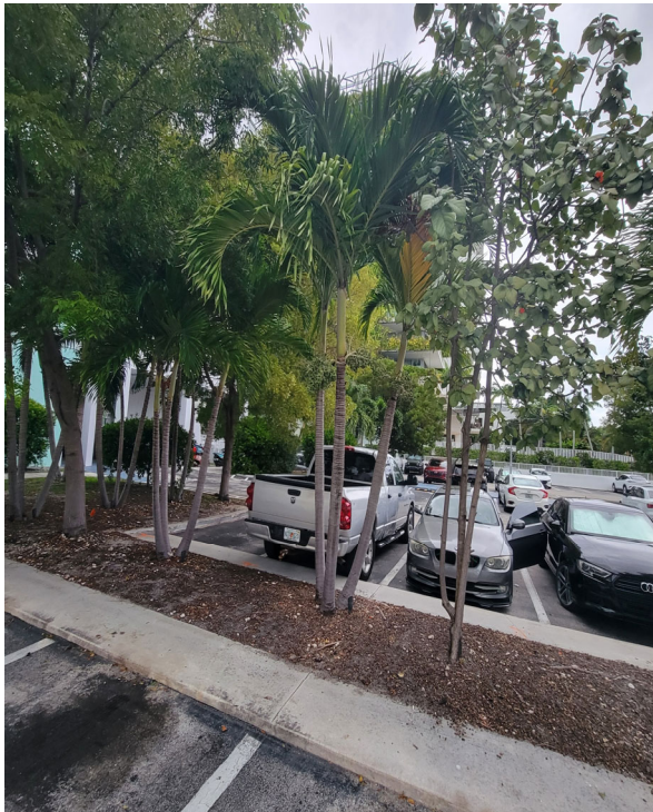
Tree 15 Christmas palm (Adonidia merrellii) 6,5,5 inch DBH, Good condition 10 foot height, 8 foot spread