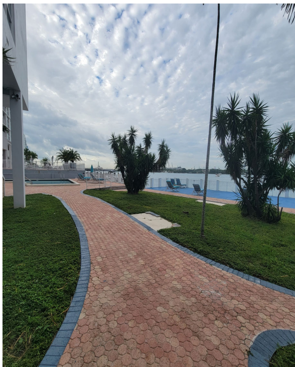
species not considered a tree