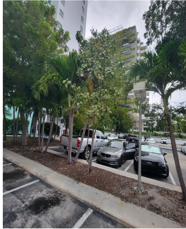
Tree 14 orange geiger (Cordia sebestena) 3 inch DBH Good condition 14 foot height, 12 foot spread