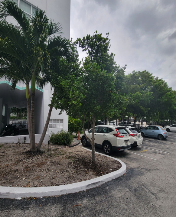
Tree 25 pigeon plum ( Coccoloba diversifolia ) 6 inch DBH, Good condition 12 foot height, 12 foot spread