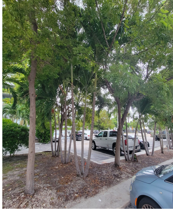
Tree 18 Christmas palm (Adonidia merrellii) 5,4,4 inch DBH Good condition 16 foot height, 8 foot spread