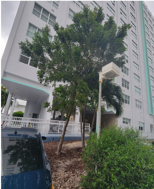
Tree 35 mahogany (Swietenia mahagoni) 6 inch DBH, Good condition 25 foot height, 25 foot spread