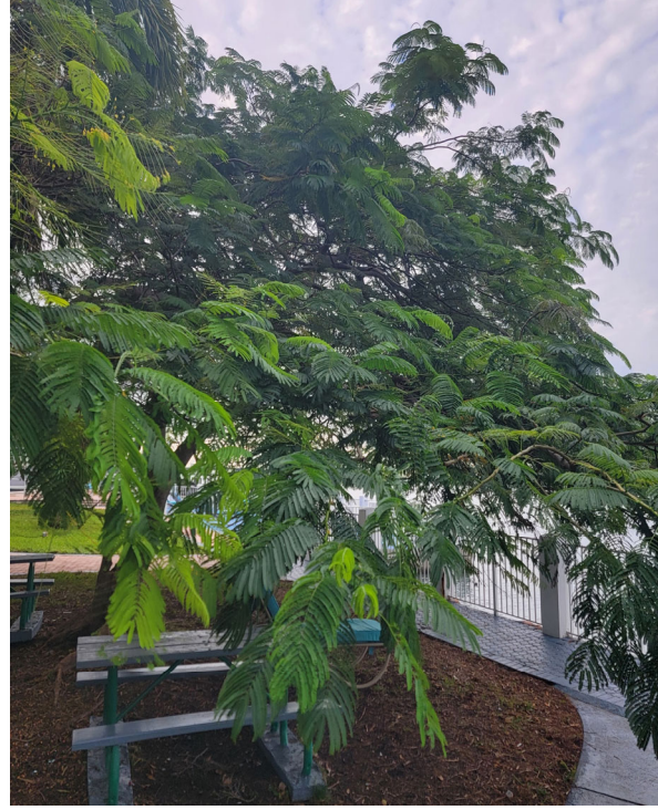
Tree 42 royal poinciana (Delonix regia) 14 inch DBH Good condition 32 foot height, 32 foot spread