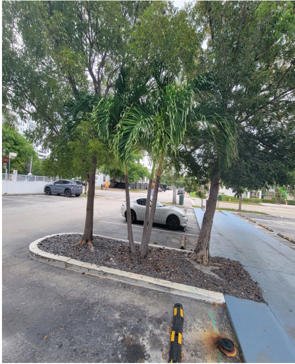
Tree 33 christmas palm (Adonidia merrellii) 5,4,4 inch DBH, Good condition 12 foot height, 6 foot spread