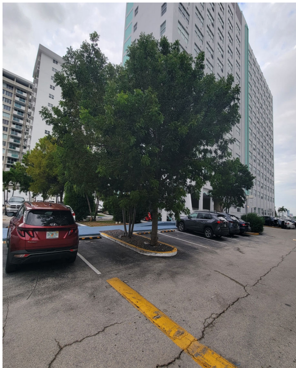
Tree 31 mahogany (Swietenia mahagoni) 12 inch DBH, Good condition 30 foot height, 30 foot spread