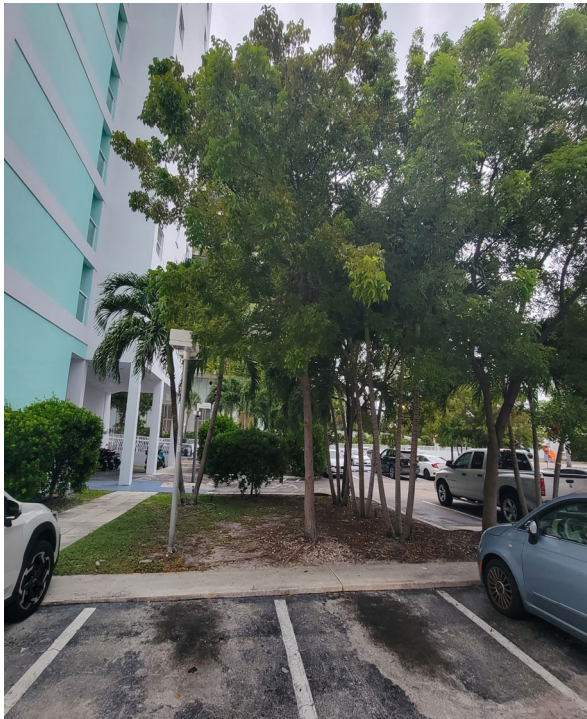
Tree 19 mahogany (Swietenia mahagoni) 7 inch DBH, Good condition 28 foot height, 25 foot spread