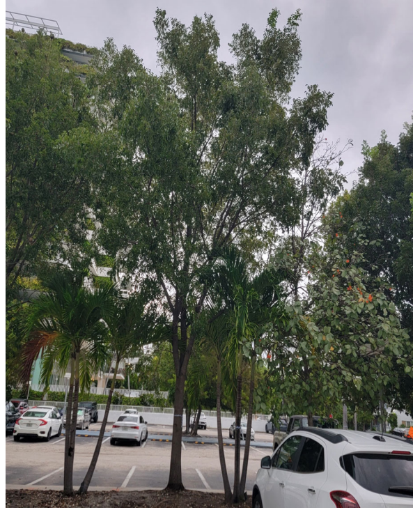
Tree 10 mahogany ( Swietenia mahagoni ) 9 inch DBH Good condition 35 foot height, 25 foot spread