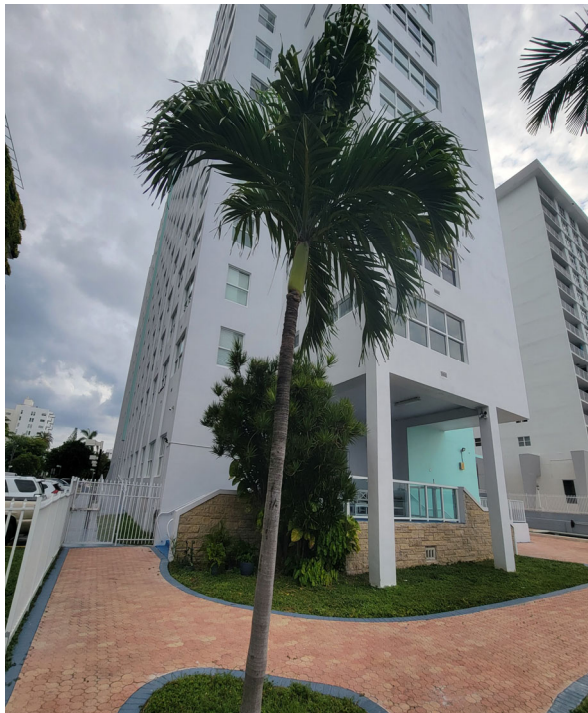
Tree 43 Alexander palm (Archontophoenix alexandrae) 6 inch DBH, Good condition 18 foot height, 6 foot spread