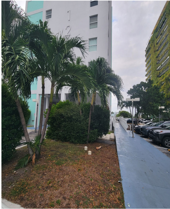
Tree 29 christmas palm (Adonidia merrellii) 5,5,5 inch DBH, Good condition 12 foot height, 6 foot spread