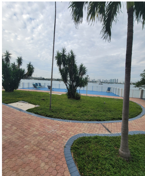
species not considered a tree