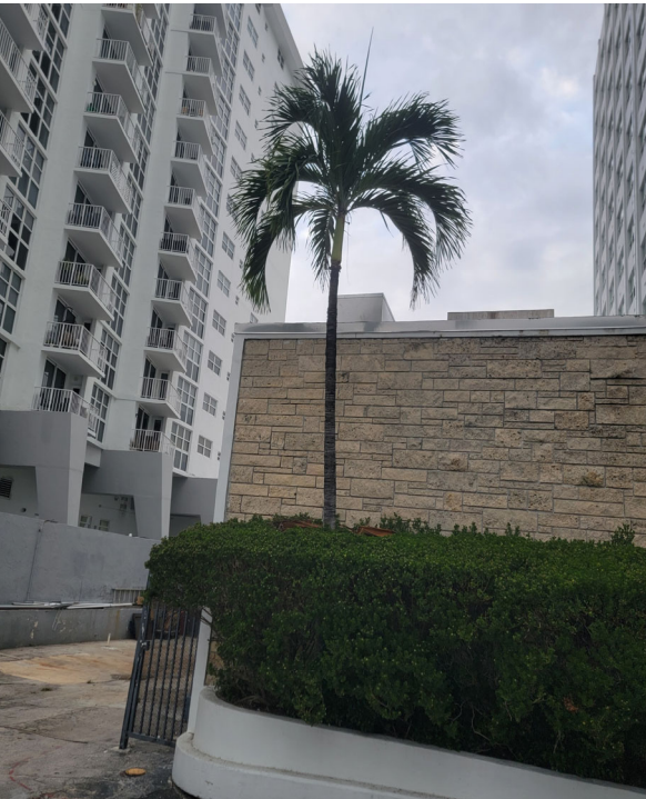
Tree 27 Alexander palm ( Archontophoenix alexandrae ) 8 inch DBH, Good condition 25 foot height, 6 foot spread