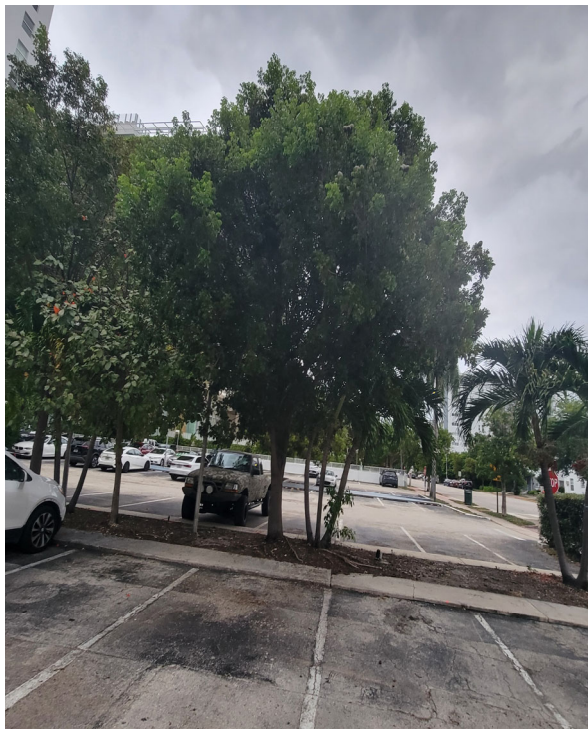
Tree 7 mahogany ( Swietenia mahagoni ) 12 inch DBH, Good condition 22 foot height, 25 foot spread