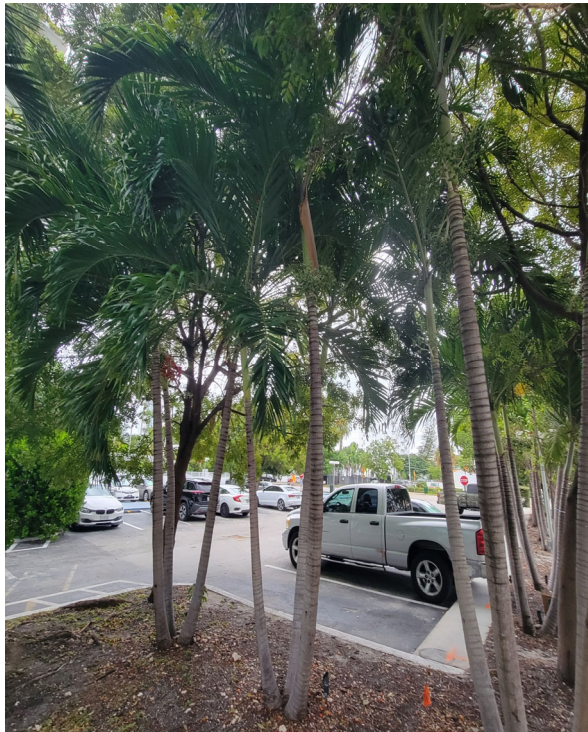
Tree 21 Christmas palm ( Adonidia merrellii ) 6,5,4 inch DBH, Good condition 16 foot height, 8 foot spread