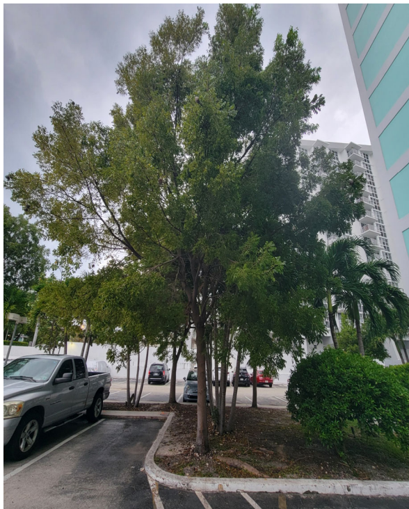
Tree 23 mahogany ( Swietenia mahagoni ) 10 inch DBH, Good condition 35 foot height, 35 foot spread