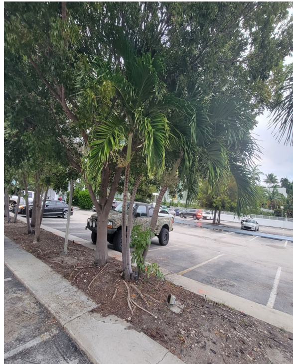
Tree 6 Christmas palm ( Adonidia merrellii ) 5,4,4 inch DBH Good condition 12 foot height, 8 foot spread