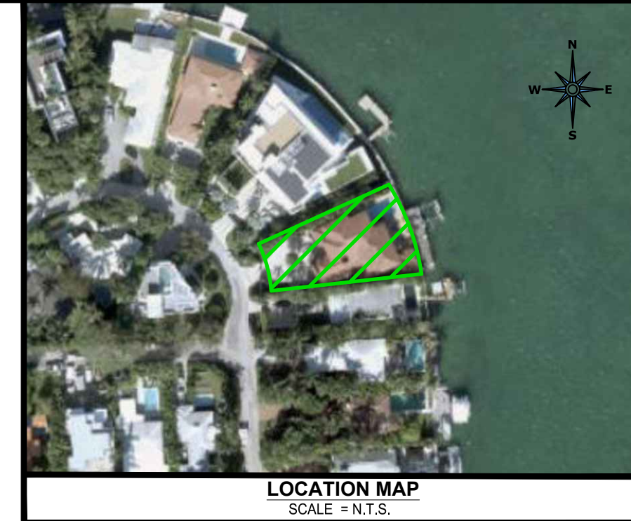
LOCATION MAP SCALE = N.T.S.