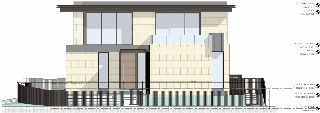
1 NORTH FENCE ELEVATION