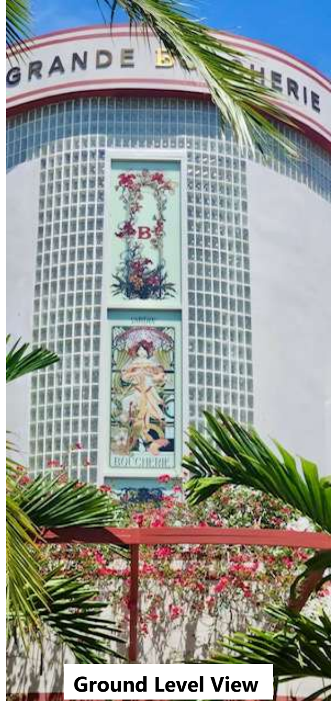
Ground Level View