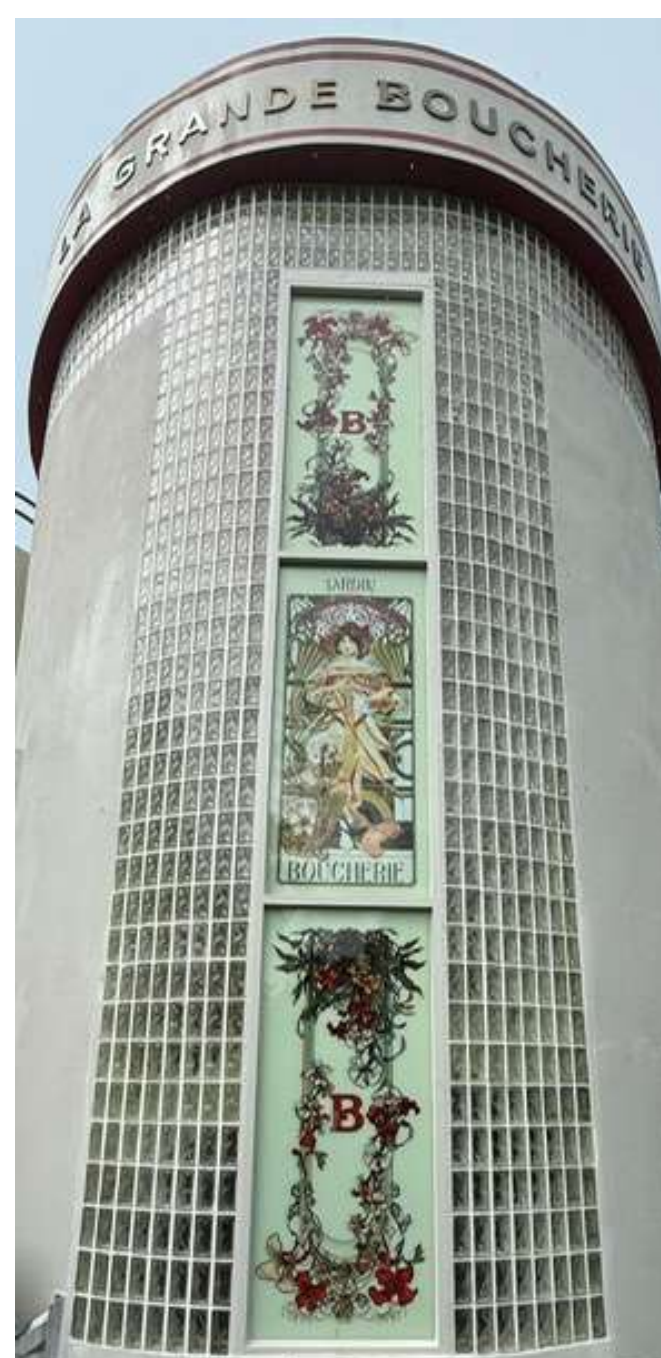
All 3 panels (view from roof)