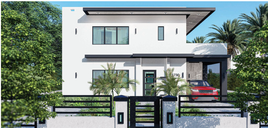
Previously proposed rendering