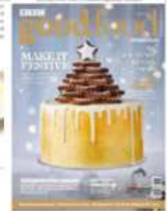
BBC GOOD FOOD MIDDLE EAST