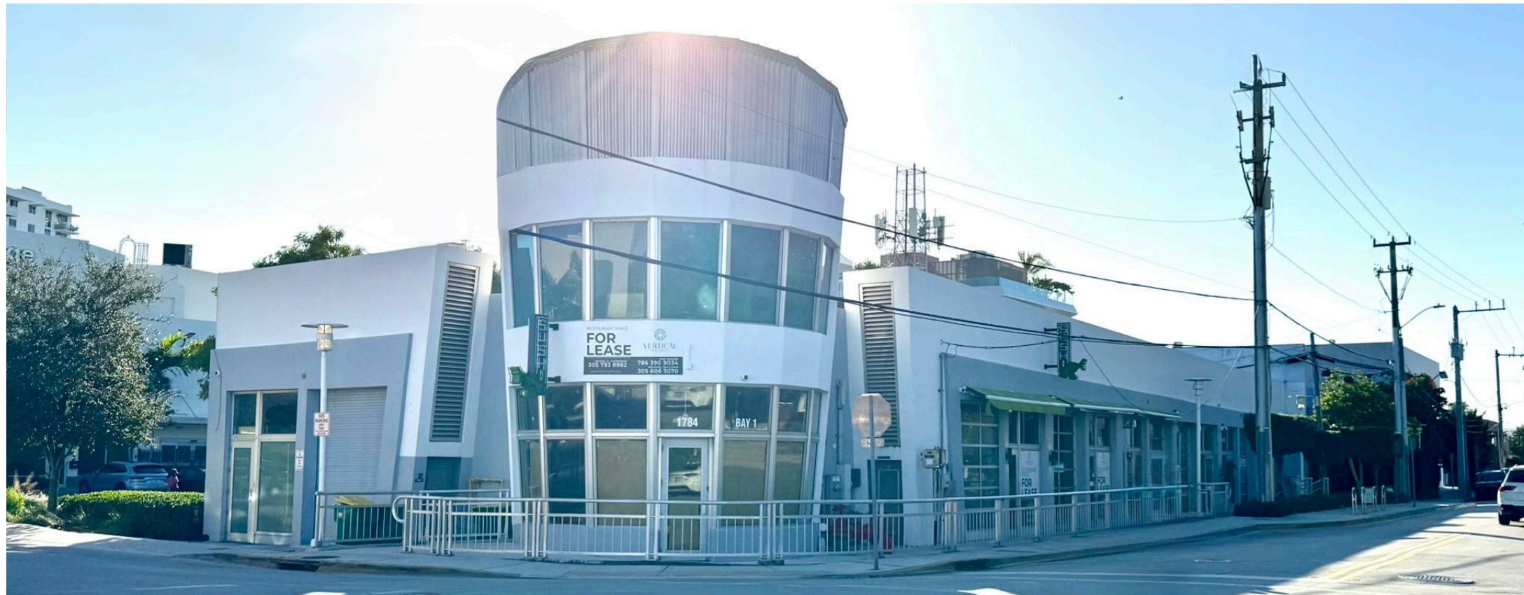
1784 West Avenue. The heart of Sunset Harbour, Miami Beach.