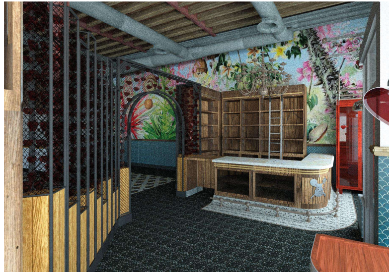
B ENTRY/ WAITING AREA- 3D VIEW