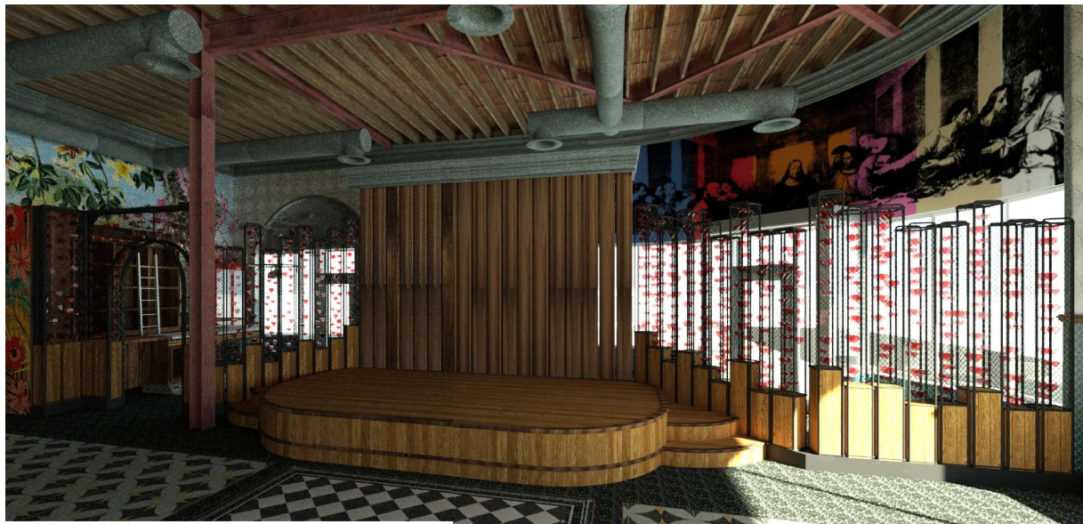
E STAGE/ DINING AREA- 3D VIEW