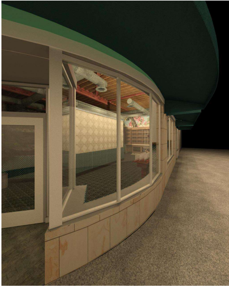
B DREXEL AVENUE - EXTERIOR RENDERING NOT TO SCALE

PROJECT NO.: 19-1007 TITLE: EXTERIOR RENDERINGS DATE: DECEMBER 2, 2019 SCALE: AS SHOWN DRAWING NO.: A-119