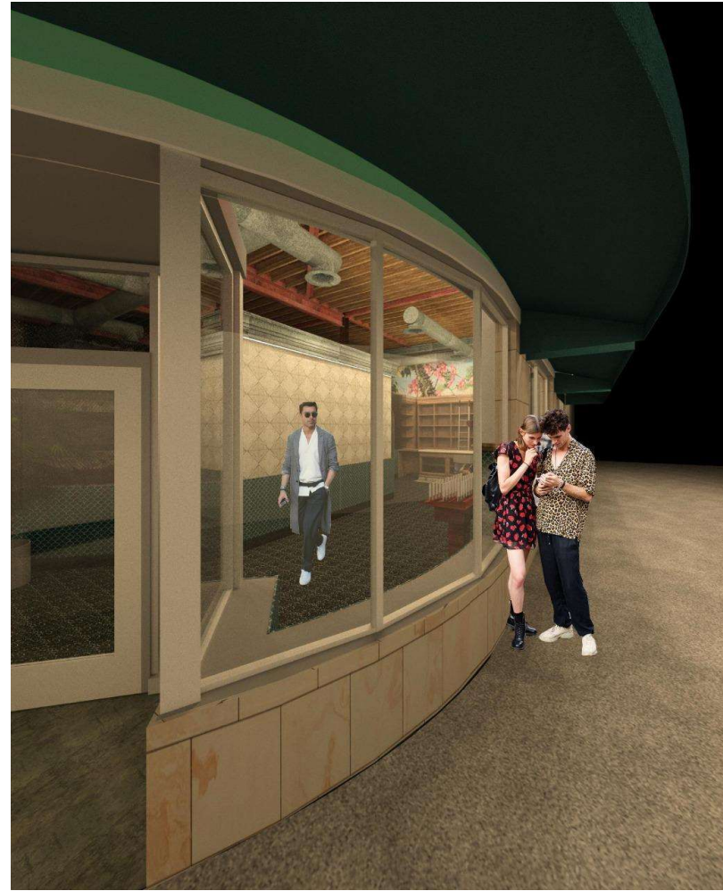
A DREXEL AVENUE - EXTERIOR RENDERING NOT TO SCALE