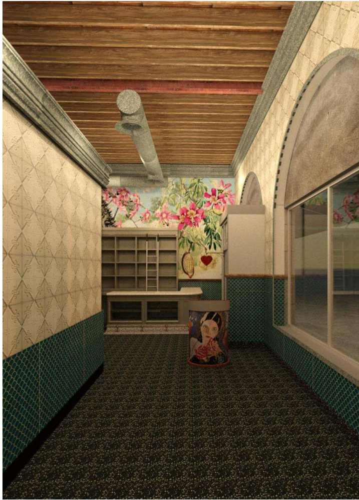
B WAITING AREA - INTERIOR RENDERING NOT TO SCALE