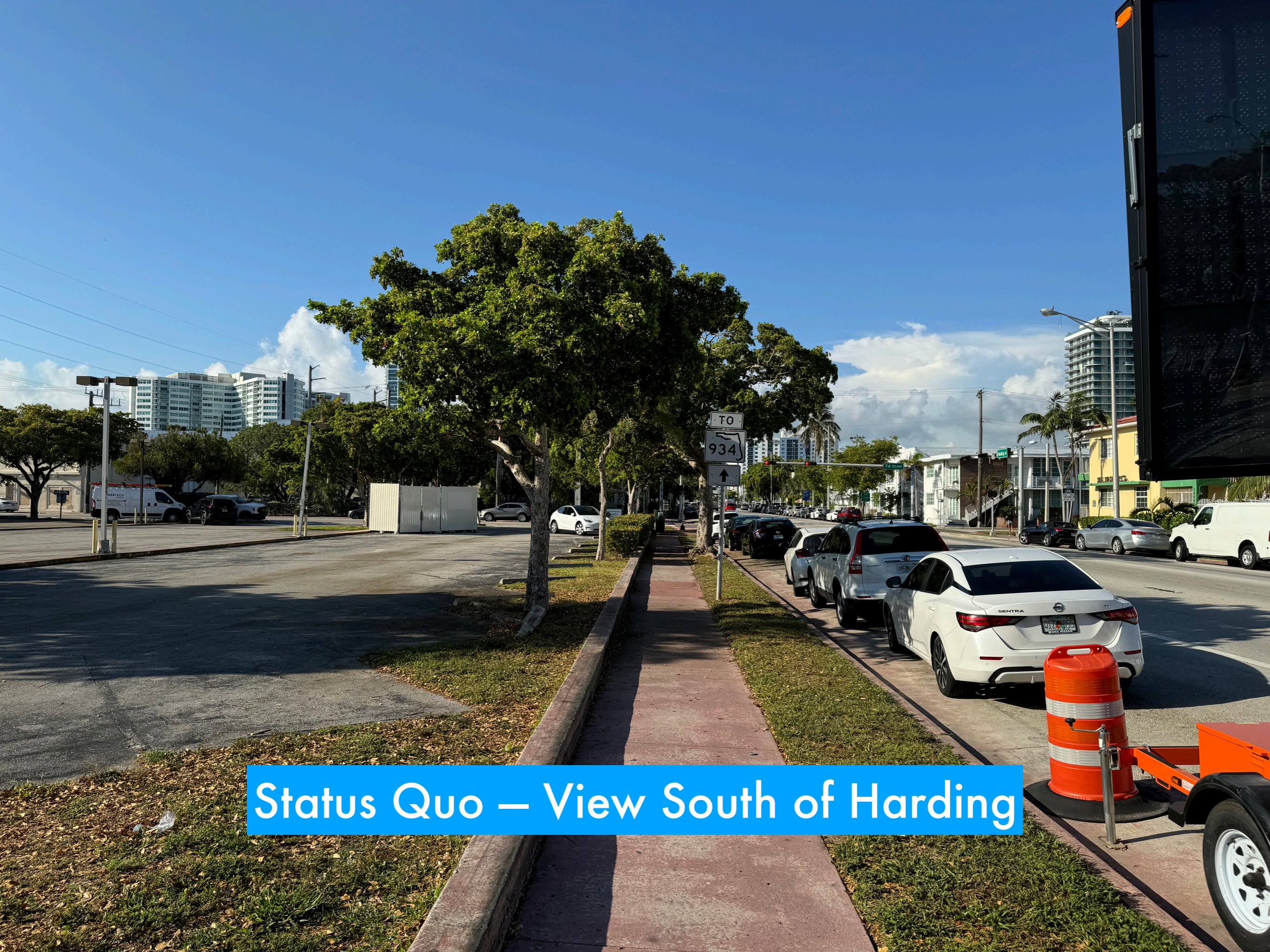
Status Quo — View South of Harding