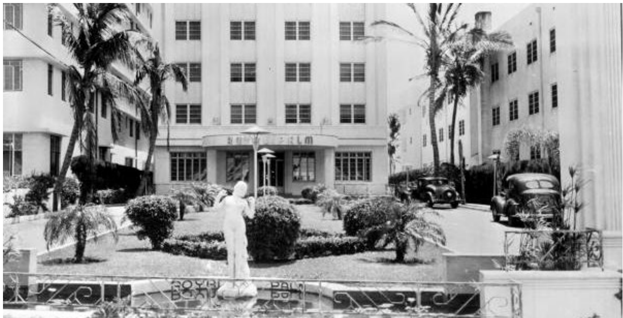
Ca. 1940 photo of the front yard and fountain of the Royal Palm Hotel

Based upon historical photographic documentation, staff believes that the current driveway configuration is substantially consistent with the driveway as originally constructed and is not supportive of the reconfiguration or the demolition of the likely original fountain. Further, staff believes that the vehicular circulation issues raised by the applicant can be resolved by converting the southern driveway to the entrance, the northern driveway to the exit. Further, a driveway could be introduced within the landscaped center area to allow cars to circle back to the garage entrance, without having to exit the property.