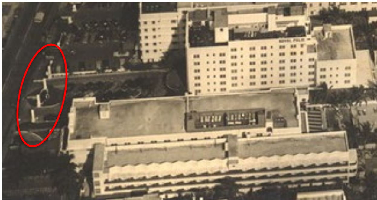
1950s aerial photo showing the original four pylons and fountain (circled in red)

With the exception of the modifications to the front driveway area, staff is highly supportive of the remainder of the project and recommends approval as noted below.