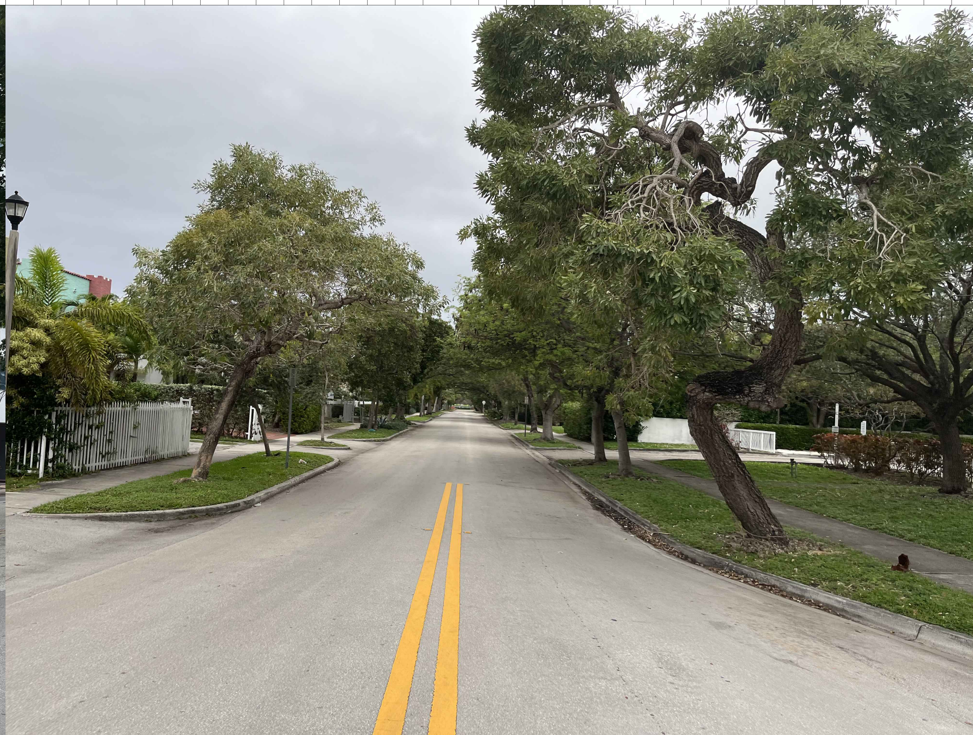
C18 JEFFERSON AVE - LOOKING NORTH