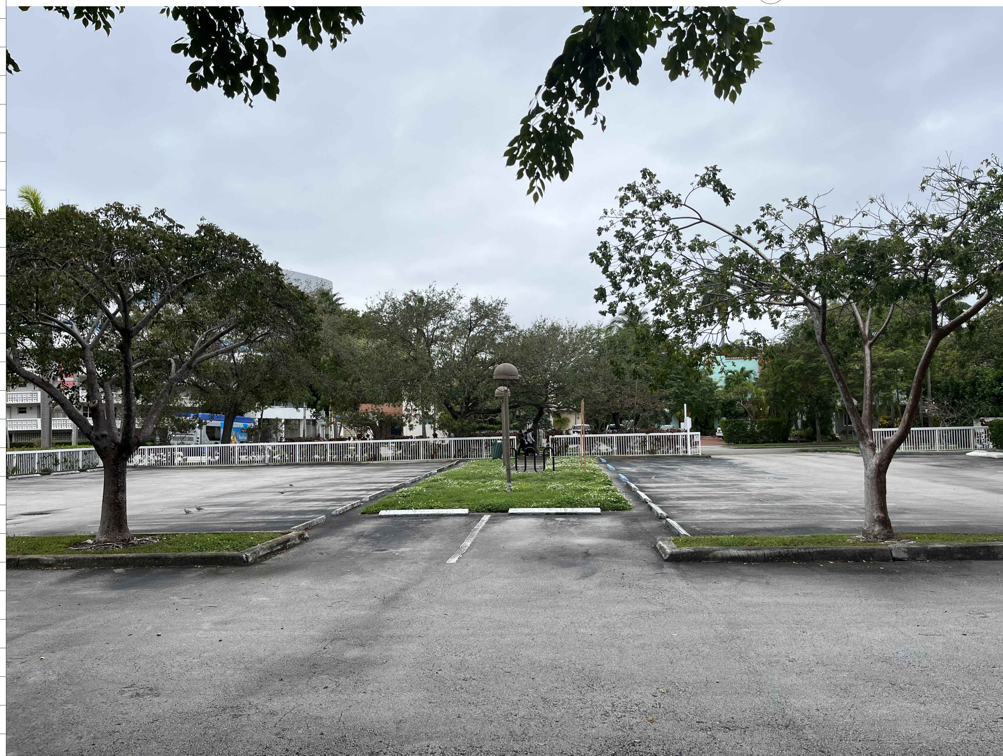
S3 SITE LOOKING WEST