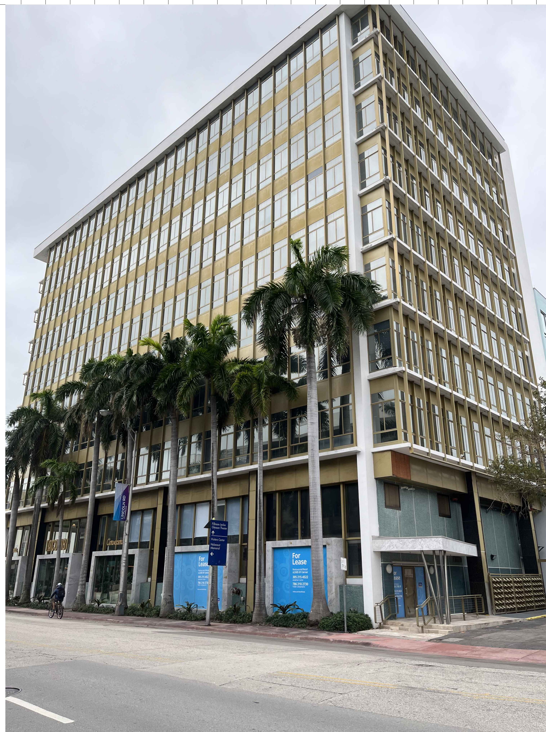
C13 1688 MERIDIAN AVE