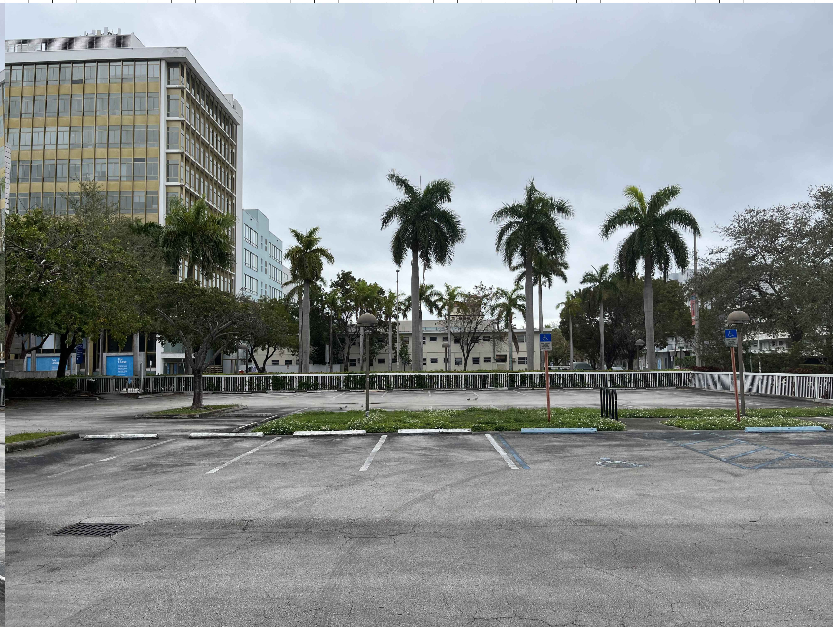
S2 SITE LOOKING SOUTH