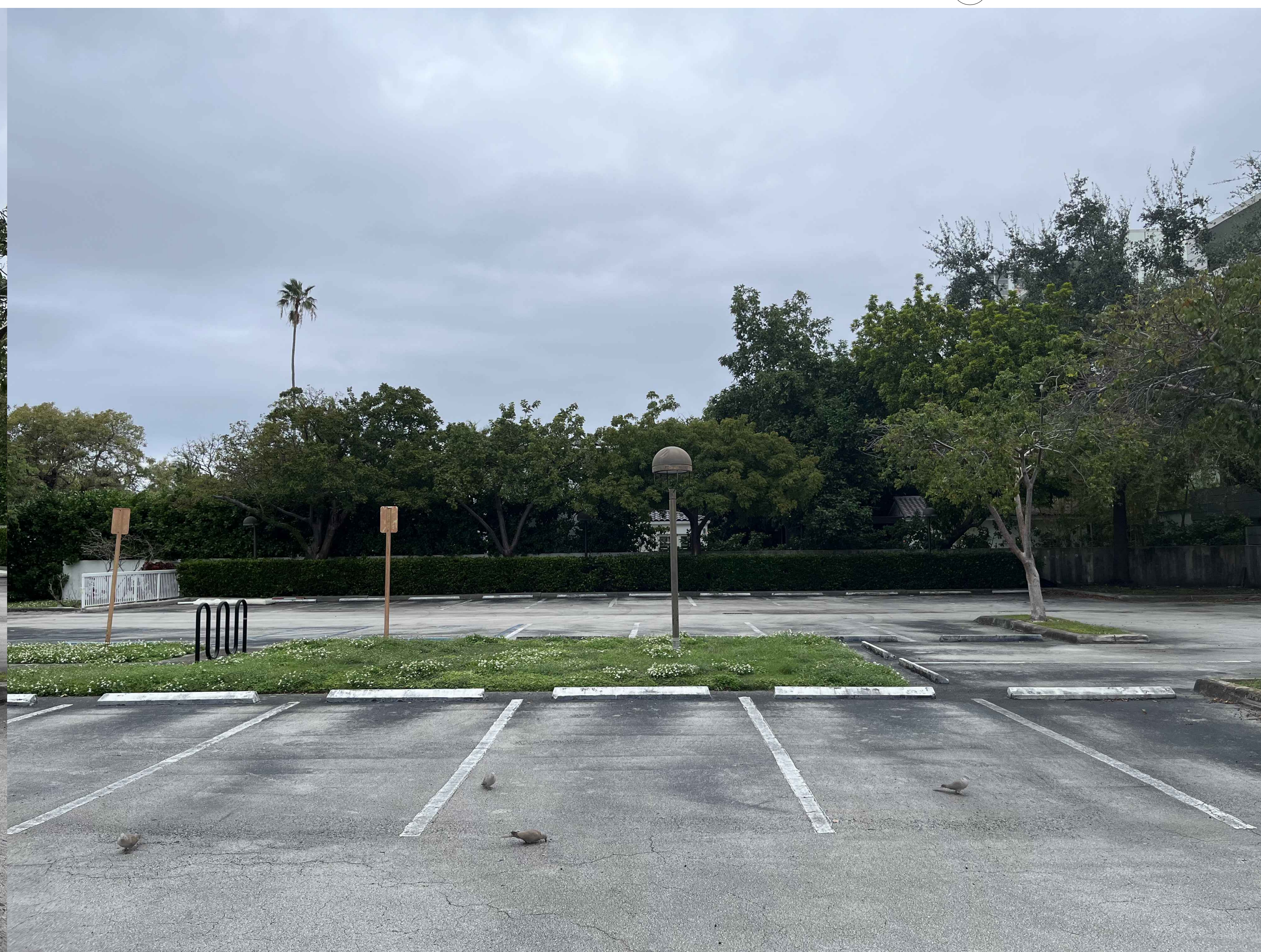
S4 SITE LOOKING NORTH