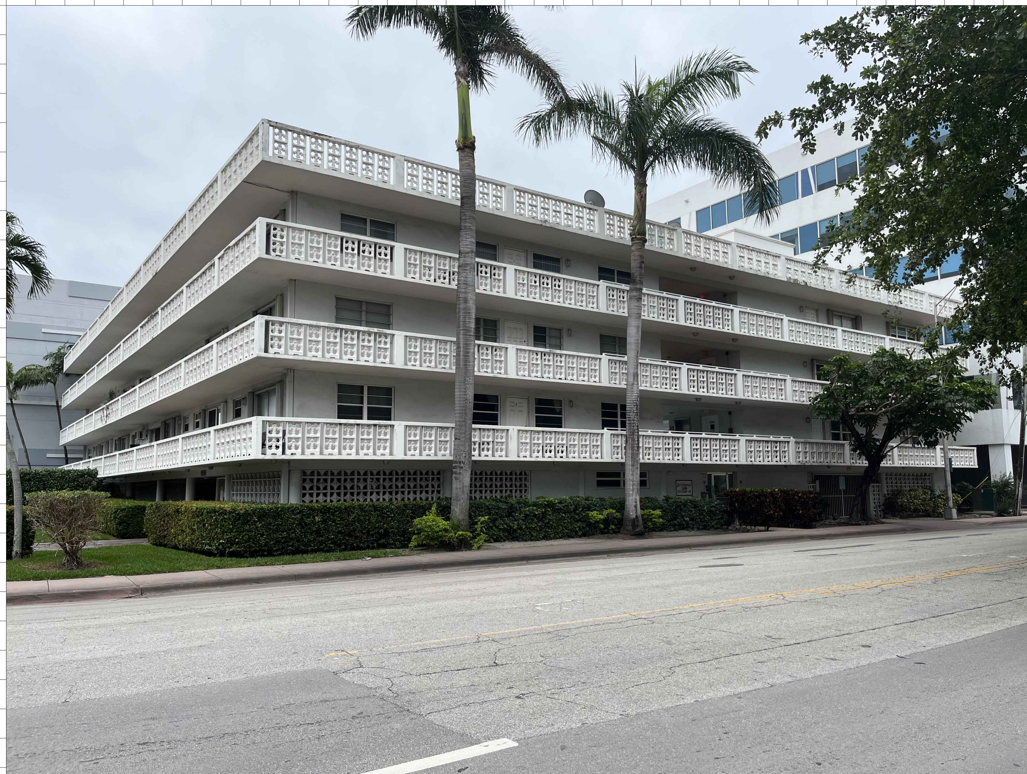
C17 1698 JEFFERSON AVE