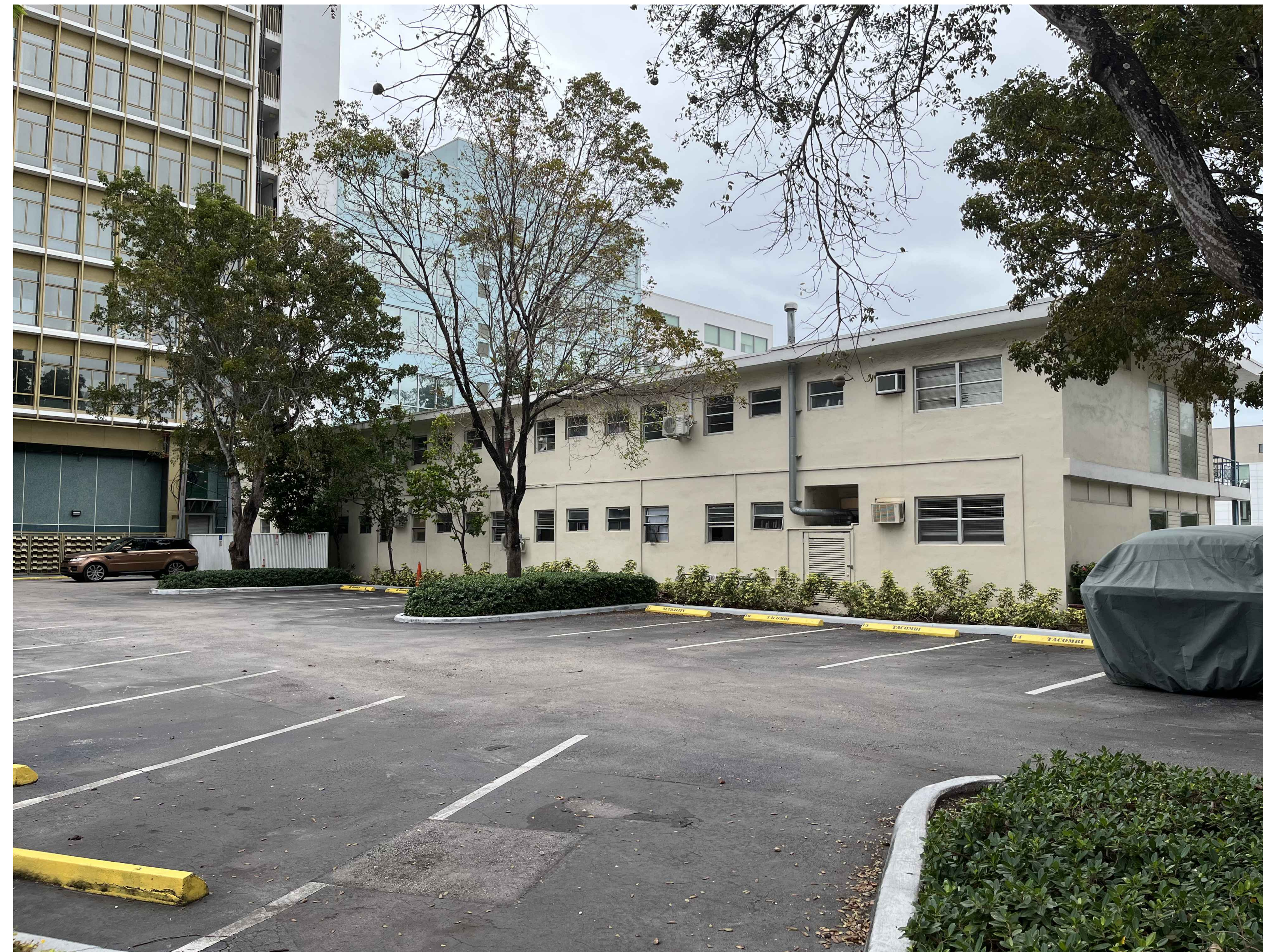
C14 1685 JEFFERSON AVE