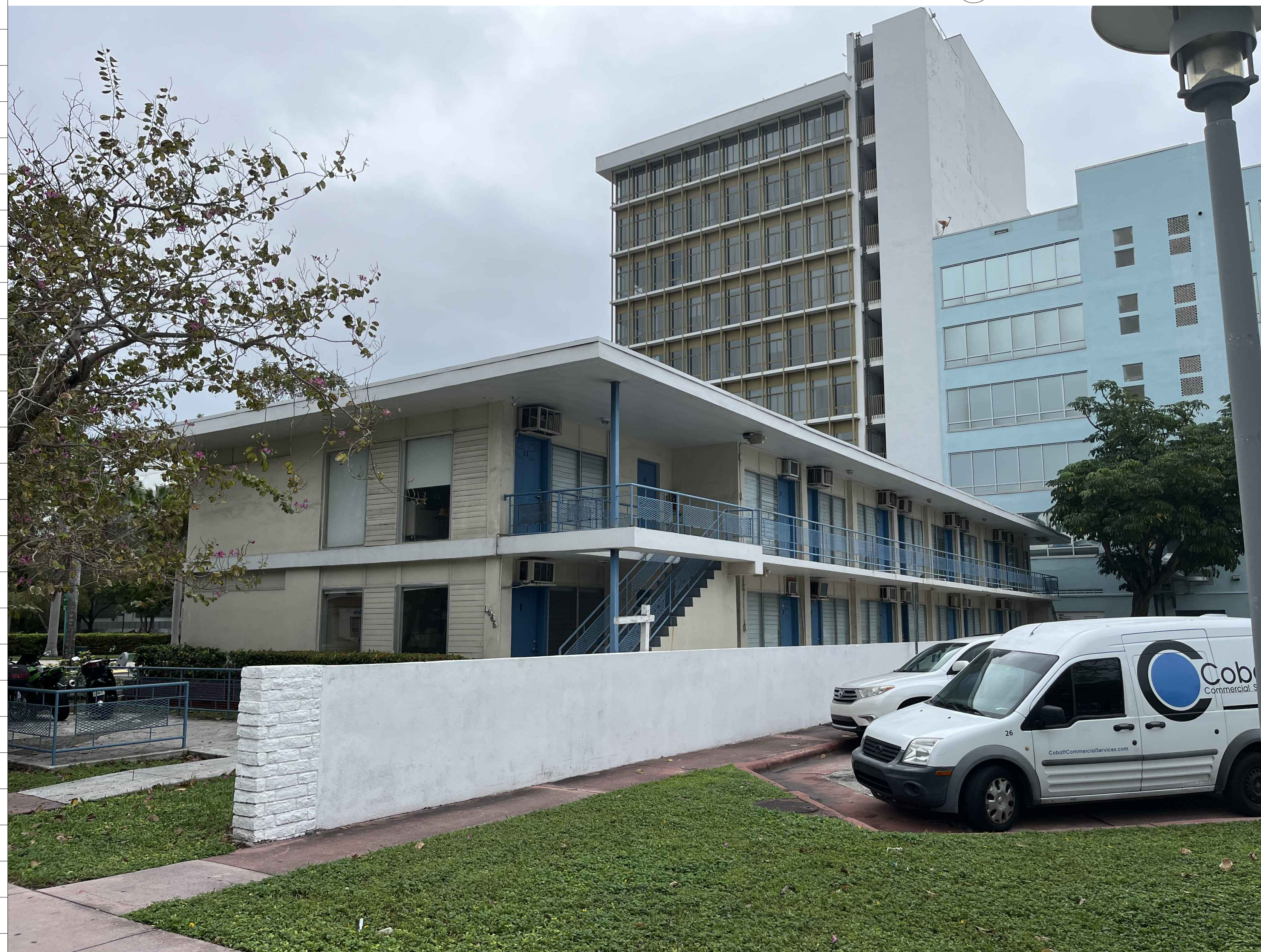
C15 1685 JEFFERSON AVE