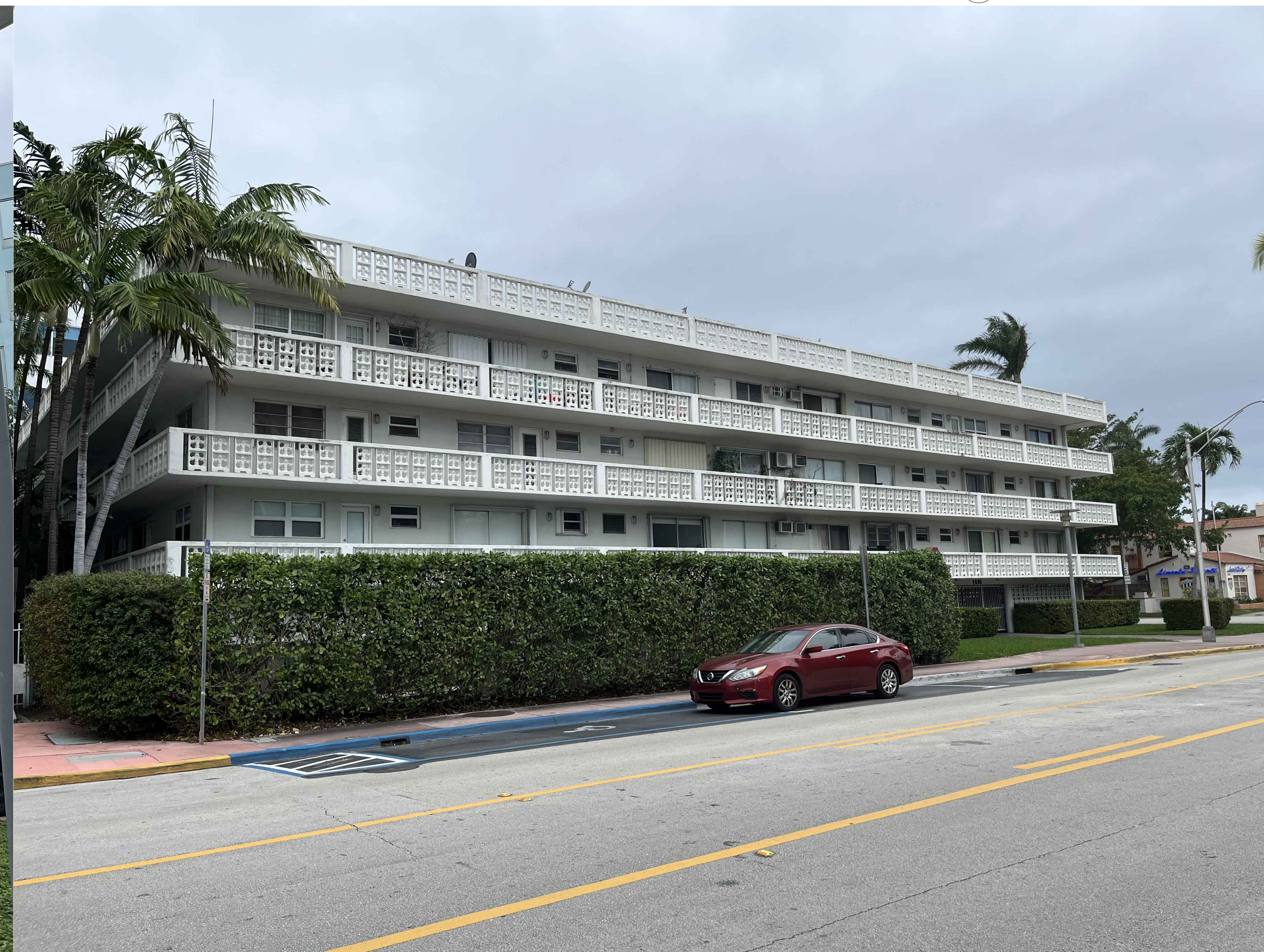
C16 1698 JEFFERSON AVE