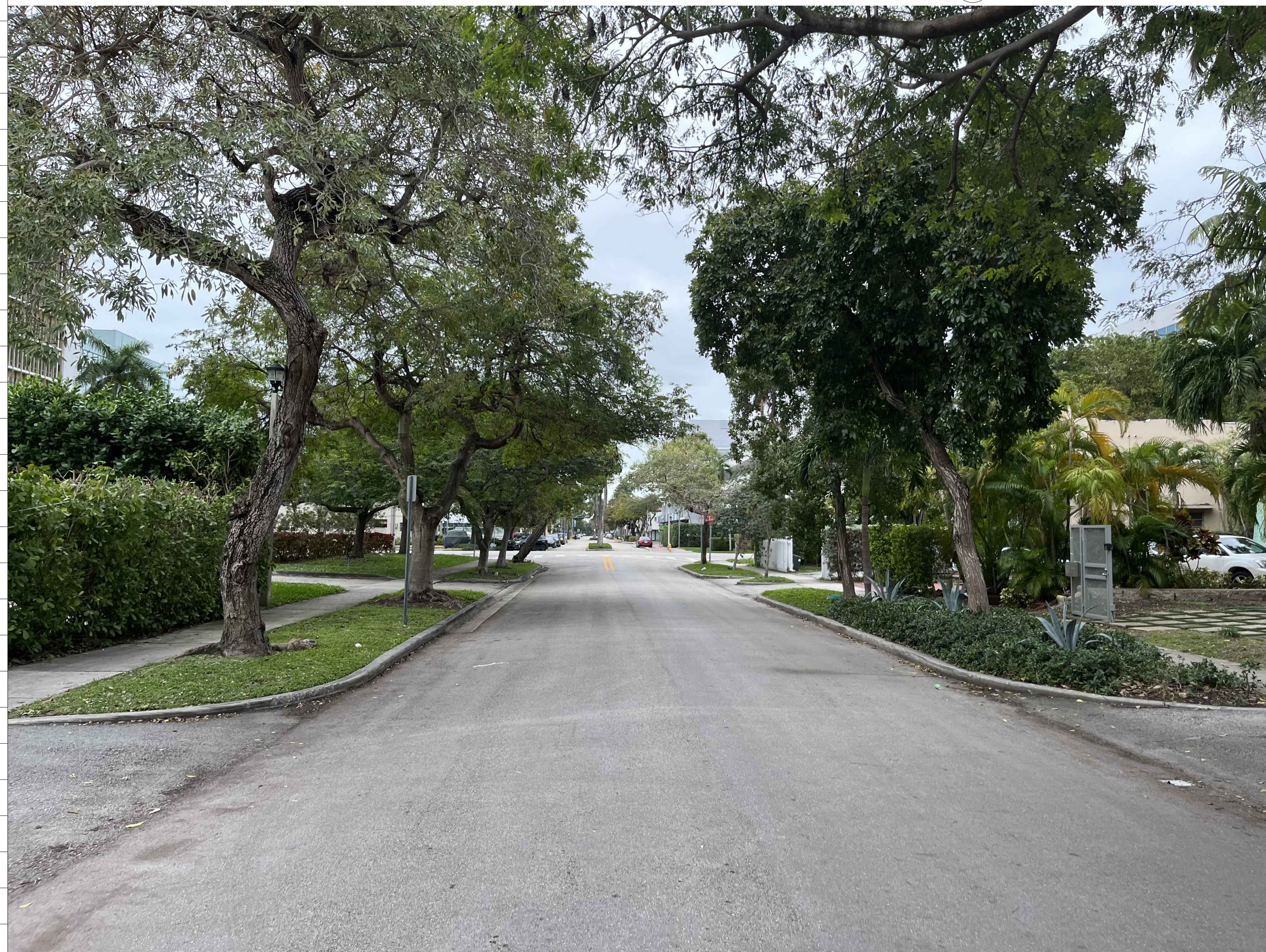
C19 JEFFERSON AVE - LOOKING SOUTH