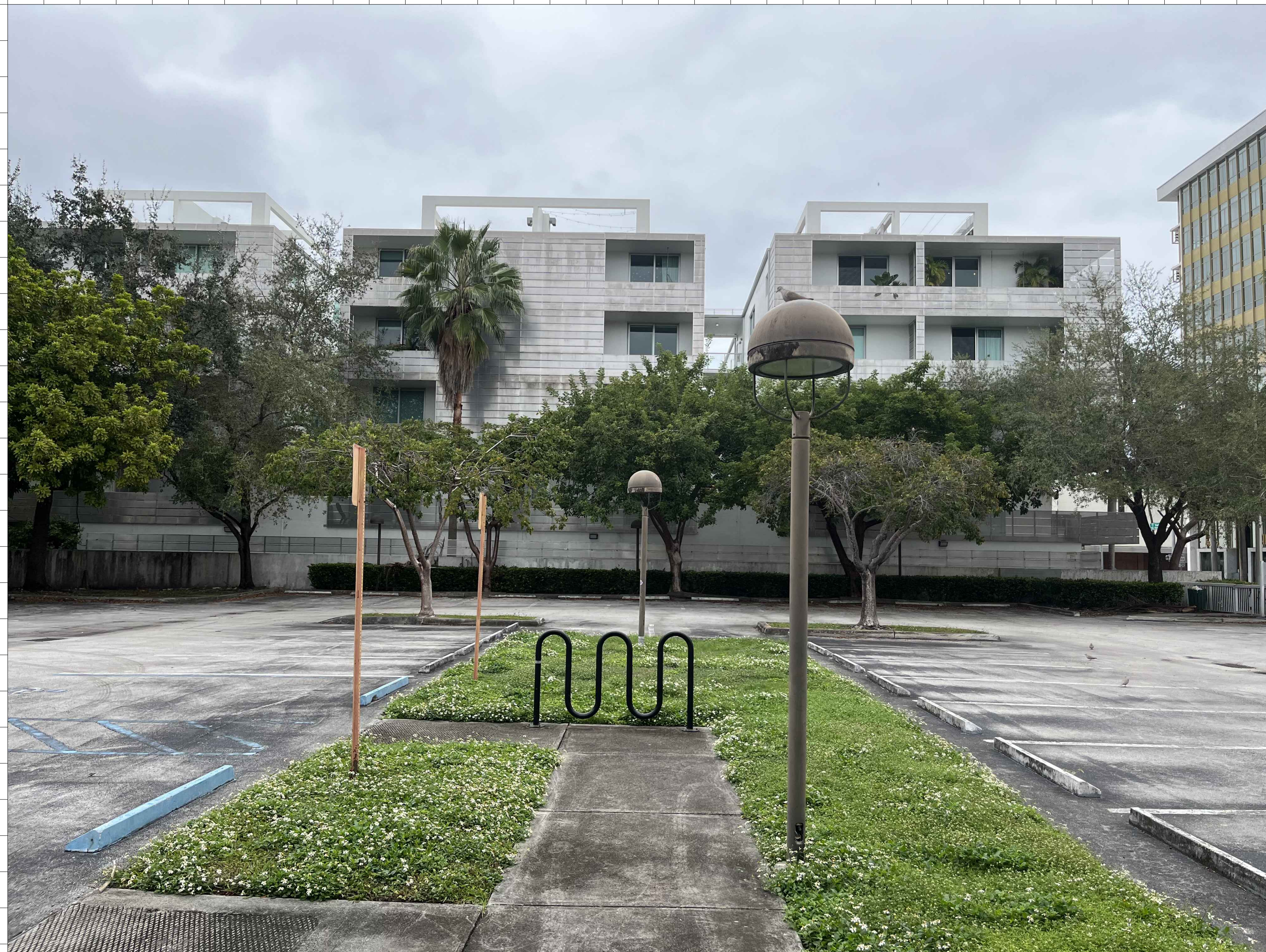
S1 SITE LOOKING EAST